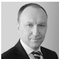
Andrey Bochkarev, Deputy Mayor of Moscow for Urban Development and Construction