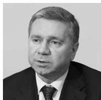
Sergey Cheremin, Minister of the Government of Moscow, Head of the Department for External Economic and International Relations