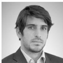
Saeed Al Alabbar, Chairman, Emirates Green Building Council