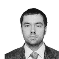
Alexey Palamarchuk, Deputy Head Moscow Department of Health