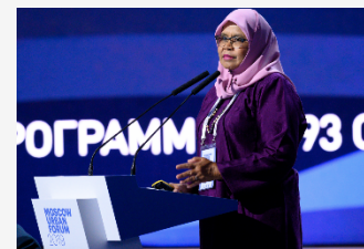
Maimunah Mohd Sharif, Under-Secretary-General, the UN, Executive Director, UN-Habitat

'Moscow's experience can be useful to a lot of cities that UN-Habitat collaborates with. I suggest that Moscow shares its experience and expertise with other cities'.