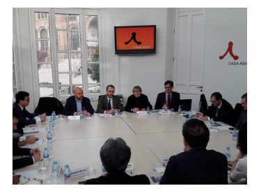
Capacities for good metropolitan governance

Sharing 46 members with Metropolis, ICLEI is one of our strategic partners. The ICLEI World Congress is a unique occasion to build partnerships and design bold and innovative ideas to steer the global urban agenda and strengthen collective action on sustainability worldwide.