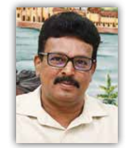
UDAY MADKAIKAR Mayor, Goa