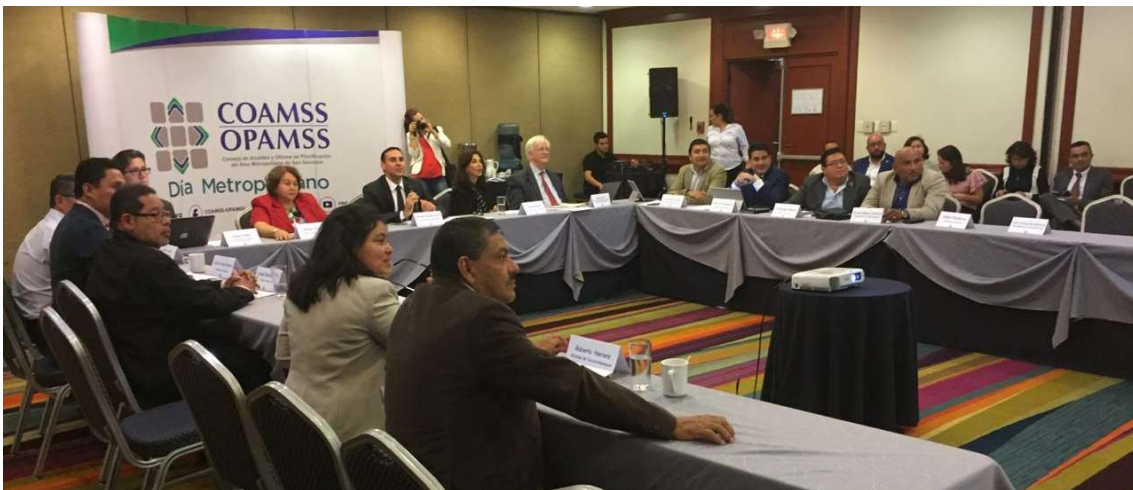
Metropolitan Day in San Salvador

As part of the main topic of the 2018 Metropolitan Day debate, the Metropolitan Area of San Salvador (AMSS) agreed to protect their water resources, improve tax collection capacity, and promote comprehensive management of solid waste. The Council of Mayors of the AMSS (COAMSS) and the technical team of its Office of Planning (OPAMSS), together with the civil service administration and local leaders, signed a letter of agreement.