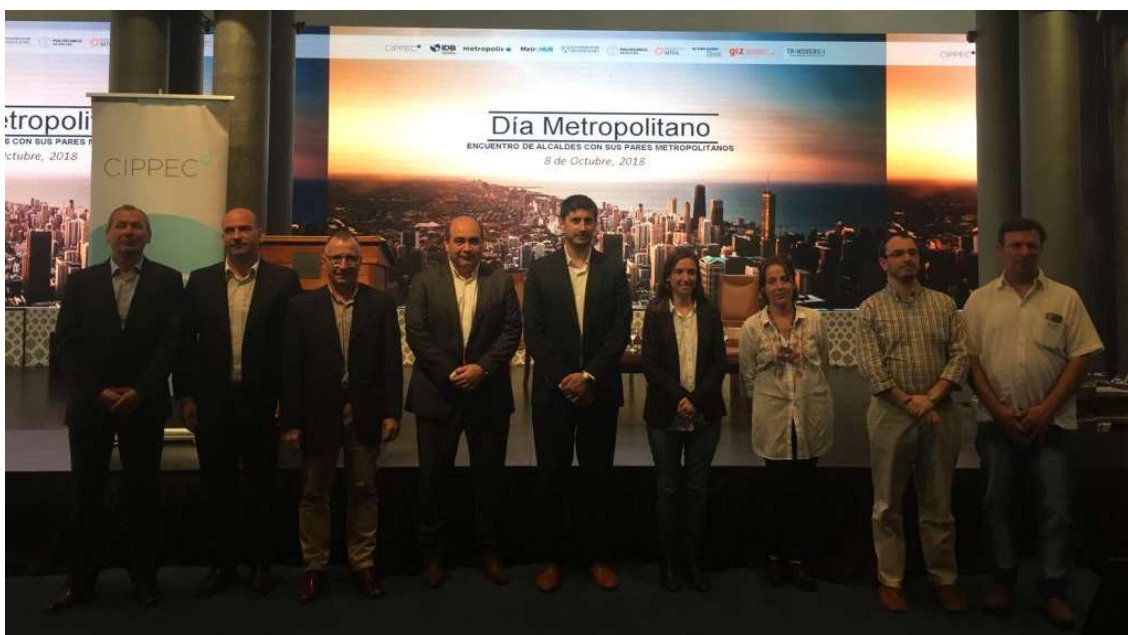
Metropolitan Area of Buenos Aires event

Progress was made on various topics, including the importance of promoting metropolitan governance through a stronger legal framework and the incorporation of climate resilience projects at the metropolitan scale.