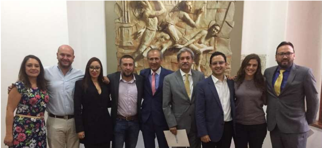
Meeting of the leaders of the Metropolitan District of Quito

The Metropolitan District of Quito celebrated Metropolitan Day in conjunction with the Habitat III + 2. The forum stood out for bringing together leaders of the nine zonal administrations that make up the urban agglomerate. Roundtable discussions focused on the impact of current actions and policies.