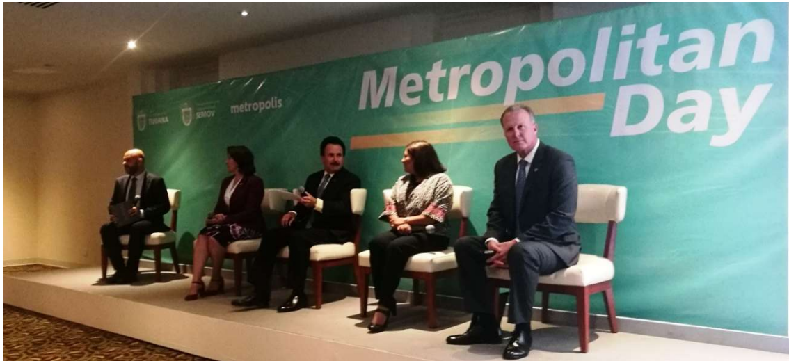
Metropolitan Day held by the Local Council of Tijuana