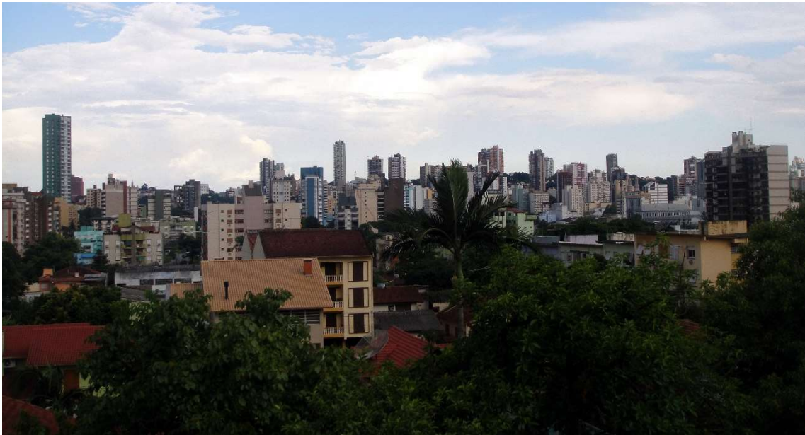
Vale dos Sinos

The city of Novo Hamburgo hosted the meeting of municipal mayors of the metropolitan region of Vale dos Sinos to discuss urban planning and economic development.