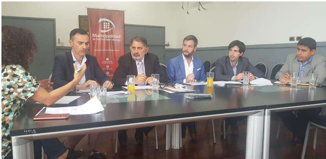
Mayors meeting of Greater Jujuy

The meeting of the mayors of the urban agglomerate of Greater San Salvador de Jujuy largely followed the recommended agenda but also included discussions on transportation. Greater Jujuy made it a priority to hold meetings between Deliberative Councils and middle managers and also confirmed participation at the 2019 Metropolitan Day.