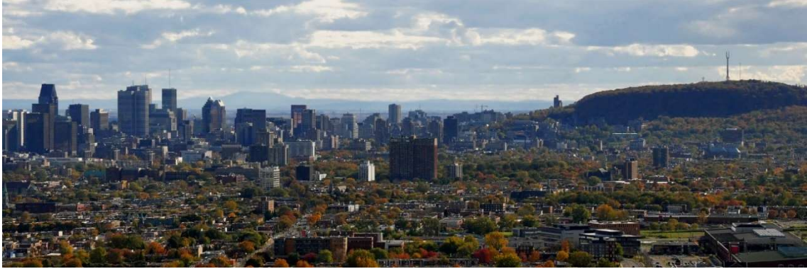
Greater Montréal

Greater Montréal celebrated the Metropolitan Day at the Metropolitan Agora event, under the slogan "to join, collaborate, succeed."