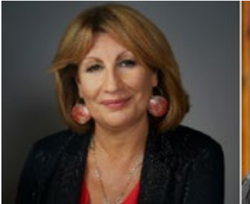
Emilia Saiz Carrancedo Secretary General, United Cities and Local Governments

Ultimately, the responsibility for ensuring all populations do have access to quality local public services lies with the state, and in particular, with local, metropolitan and regional governments. Despite the front-running role played by local and regional governments to address the COVID-19 pandemic, recovery strategies and national service delivery frameworks still fail to consistently account for the investments necessary to ensure and reinforce local public service provision. Cooperation between national, local, metropolitan and regional governments, as well as alliances with local actors, are critical for upholding such responsibility. As we move into the future, reinforcing the capacity of our local public service systems will define how cities and territories can mitigate the negative impacts of complex emergencies on their populations. The time is thus ripe to join forces and make these systems as robust as possible.