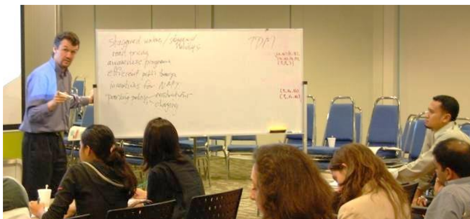
Photo: TDM course given by GTZ in Singapore, March 2008