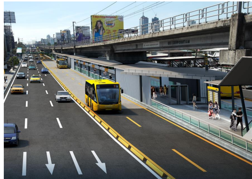
Safe and environmentally friendly vehicles