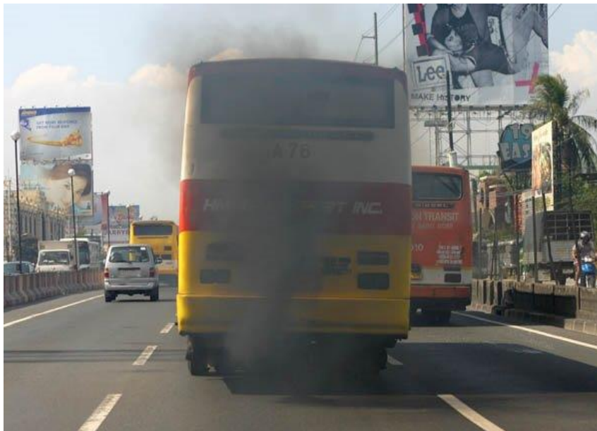
Old and polluting vehicles