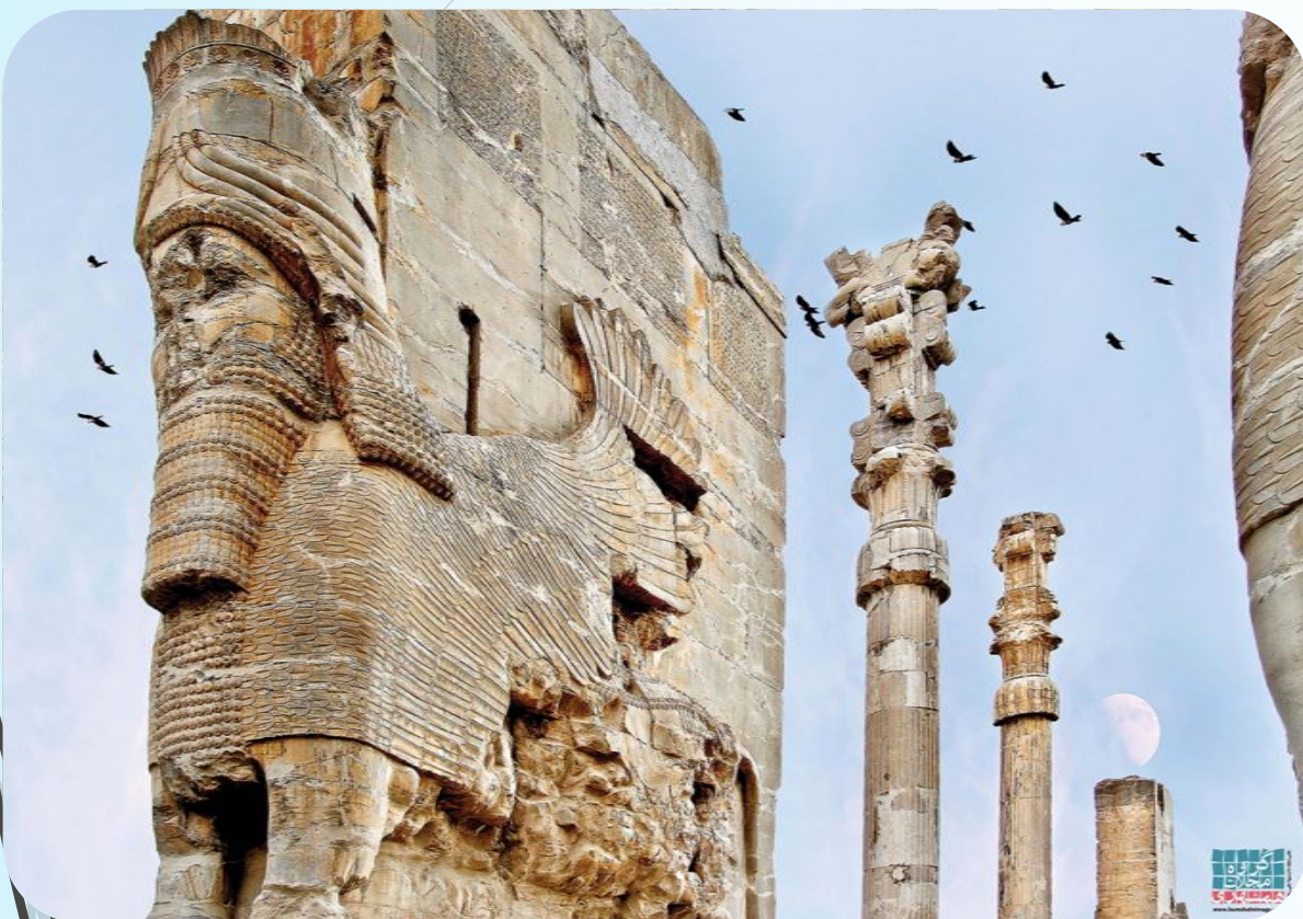
Persepolis (Takht-e Jamshid)