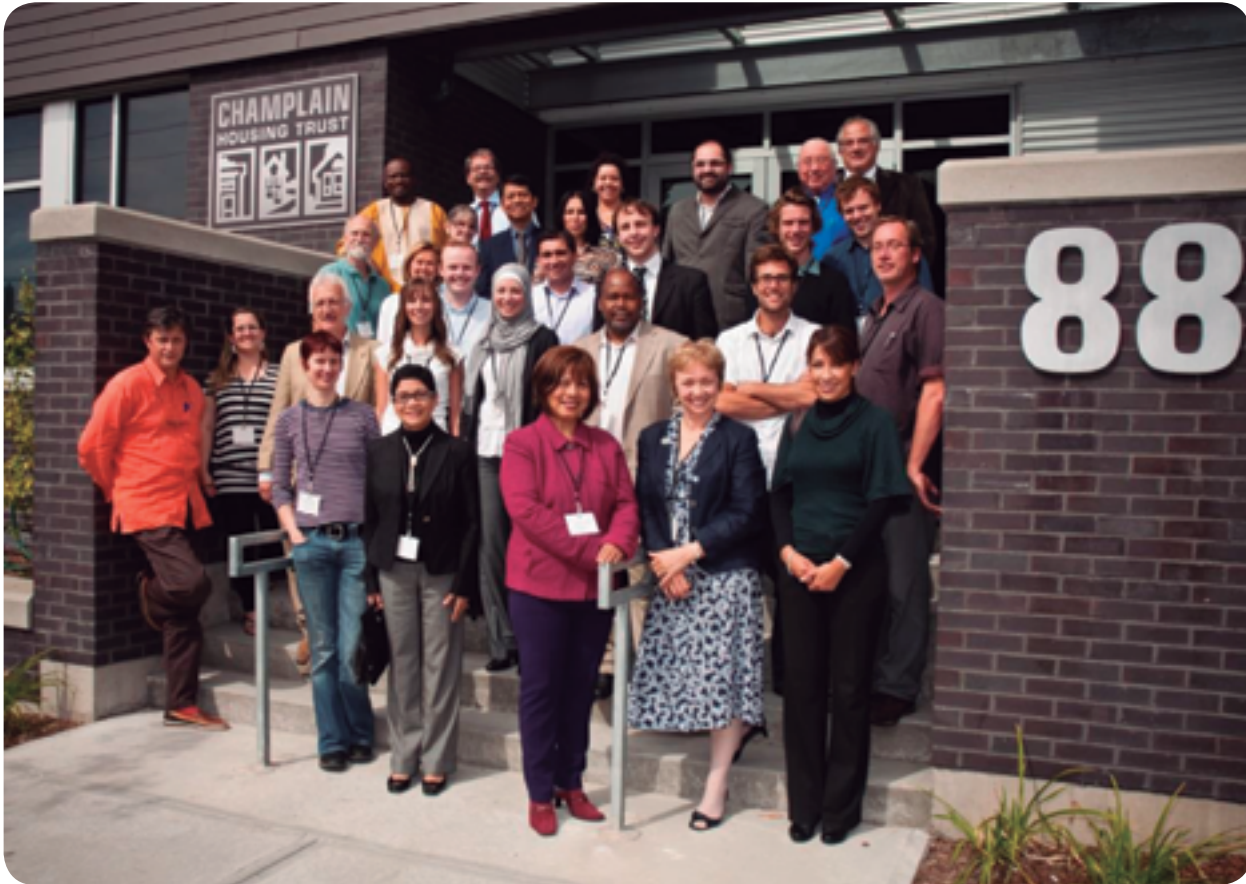
Visit of the international delegation of experts to the largest Community Land Trust, the “Champlain Housing Trust” (Burlington, Vermont, USA), after the latter had been granted the “Best Habitat Award” by the United Nations (September 2009).

by purchasing its first building in a Brussels municipality. Finally, when the Regional Parliament on Friday, 28 June 2013 adopted the amended Housing Code governing public-sector bodies in this sector, the existence of the Community Land Trust was given legal effect, alongside other forms of alternative housing such as intergenerational housing and solidarity-based housing.