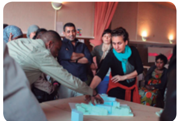
Exploratory architectural workshop in the framework of the 30 unit housing project "Arc-en-ciel", organised by CLTB with the future owners.