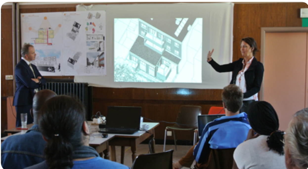
Presentation of the proposals from five architecture firms for the transformation of the first community land trust into seven low-energy households of the "Le Nid" project.

In view of the study's conclusions, the Brussels Regional Government decided to jump onto the CLT bandwagon. It agreed a certain num-