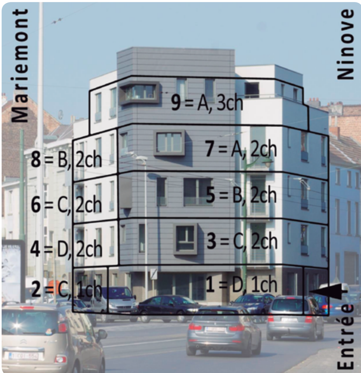
The 9 unit housing project "Mariemont" in Molenbeek (Brussel), the first to be inaugurated (early 2015)