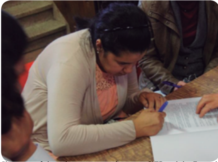
Signature of the sales agreement between CLTB and the 7 acquiring families of the first project "Le Nid" (Brussels, 17th of April 2014).