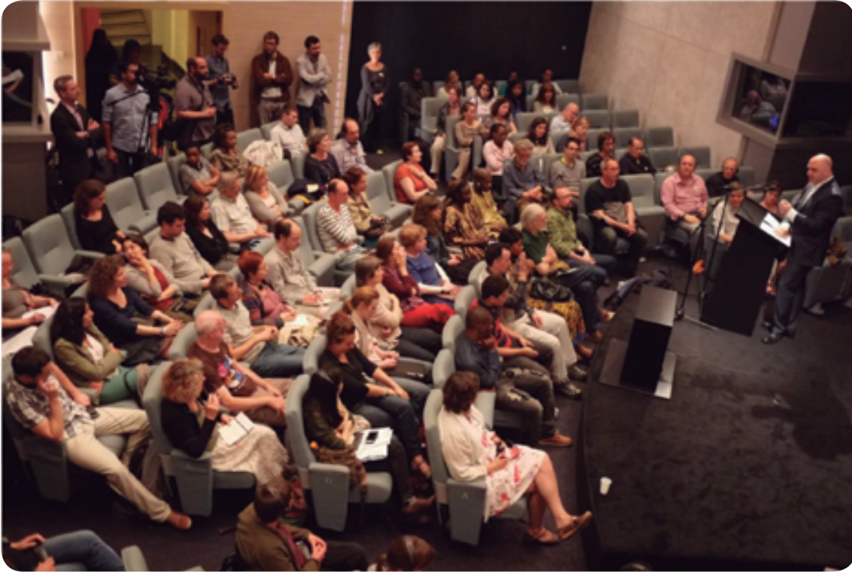
Speech by the former secretary of state for Housing of the Brussels Capital Region, during the international conference organised by CLTB: “Knowledge Building Across Community Land Trusts in Europe and the United States” (Brussels, 1st and 2nd of July 2013).

This process proved to be remarkably successful, with the L’Espoir project set up in Molenbeek in 2010, making it possible to house 14 low-income families. After 5 years, the social blueprint to erect this model building finally took form in the Rue Fin straat in Molenbeek-Saint-Jean. This innovative home ownership project undertaken by the Housing Fund combines ecology - it is an ecologically passive building - and socially cohesive housing.