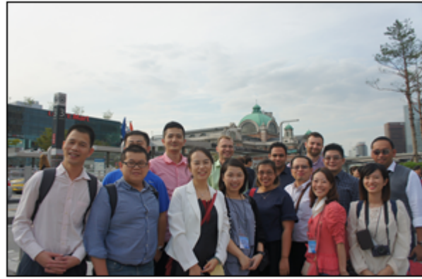
Seoul Station Bus Transfer Center