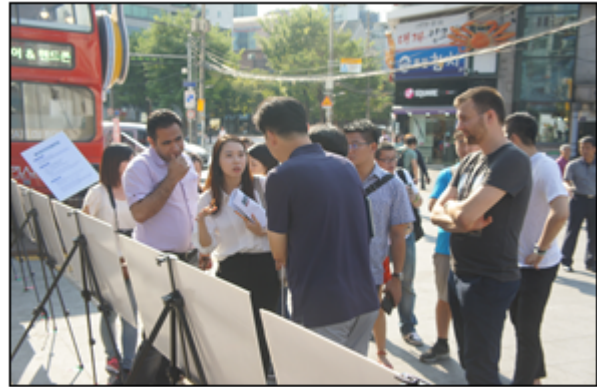
Public Transport-Only Zone